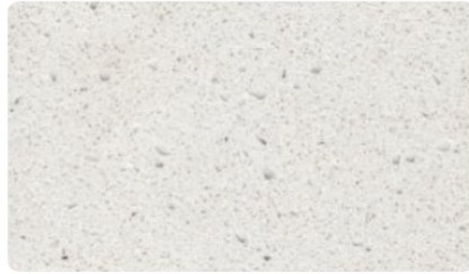
Snow glacier white