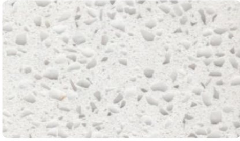
Snow white 33