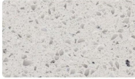
Snow pepper salt