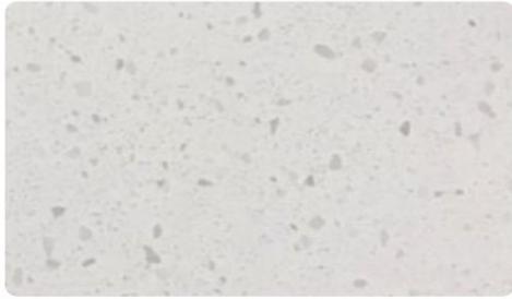
Snow ice white