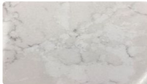
Carrara white 01

HSC is proud to be a Mincey Marble Preferred Installation Company!