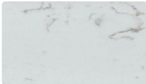
Carrara white 50