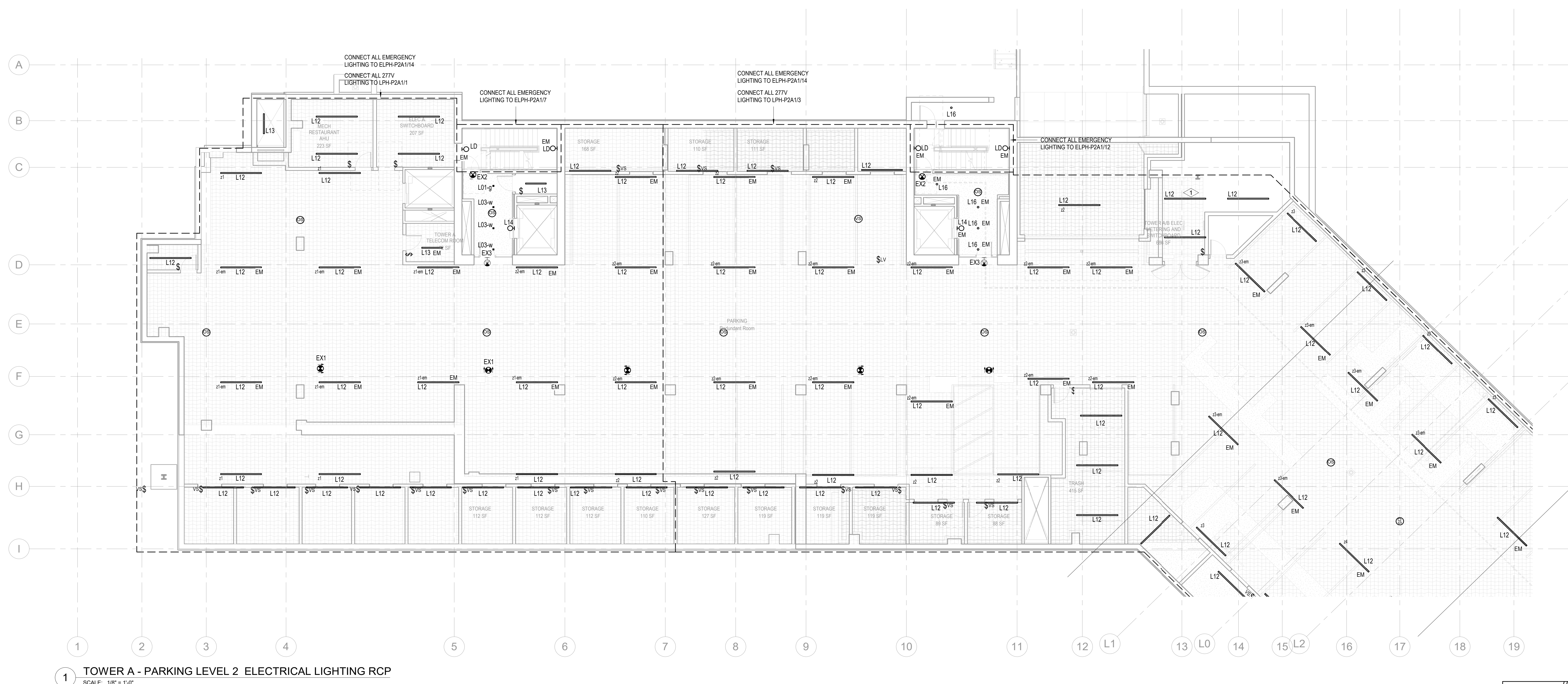
1 TOWER A - PARKING LEVEL 2 ELECTRICAL LIGHTING RCP SCALE: 1/8" = 1'-0"