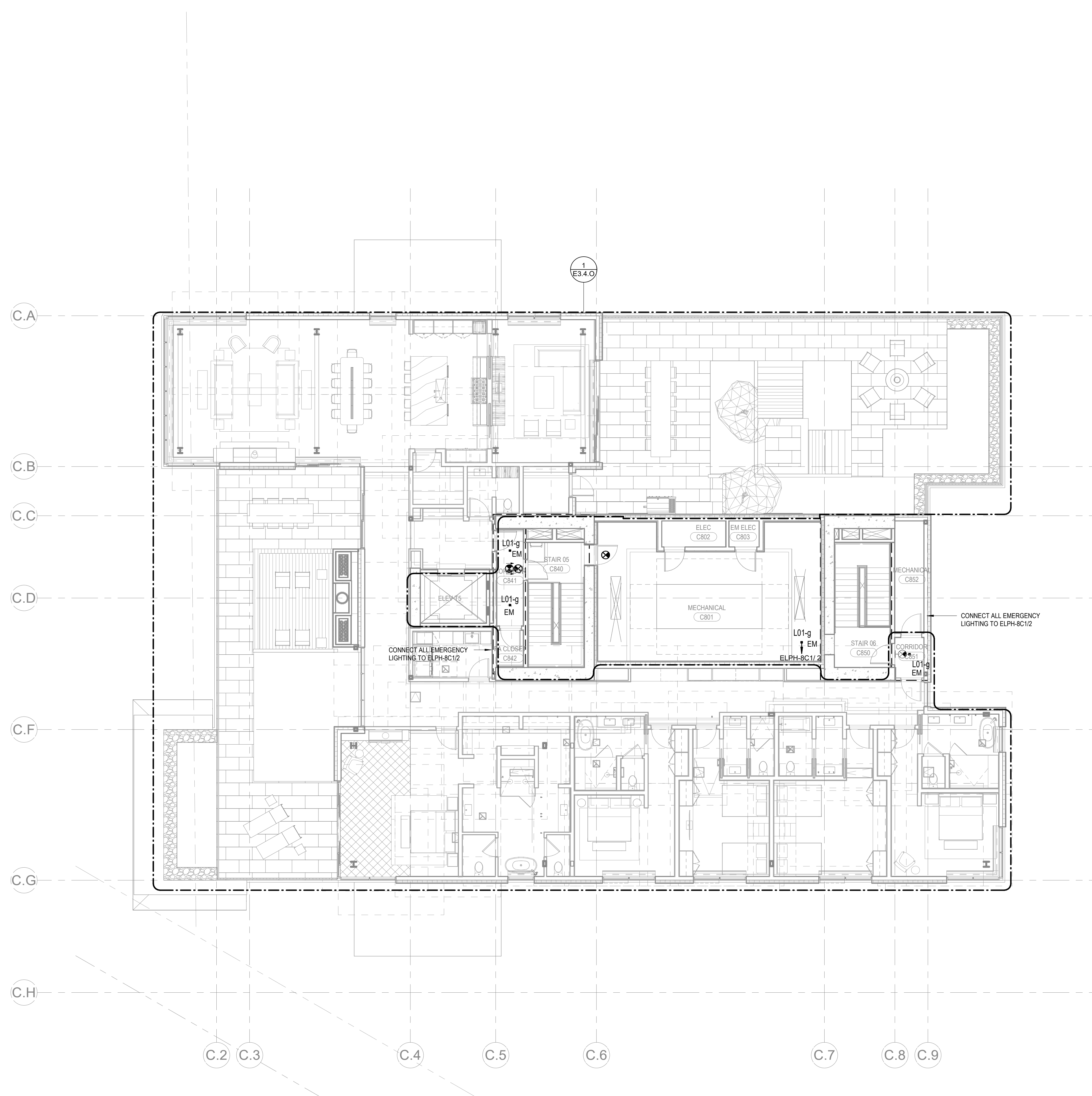
1 LEVEL 8 LIGHTING PLAN SCALE: 1/8" = 1'-0"