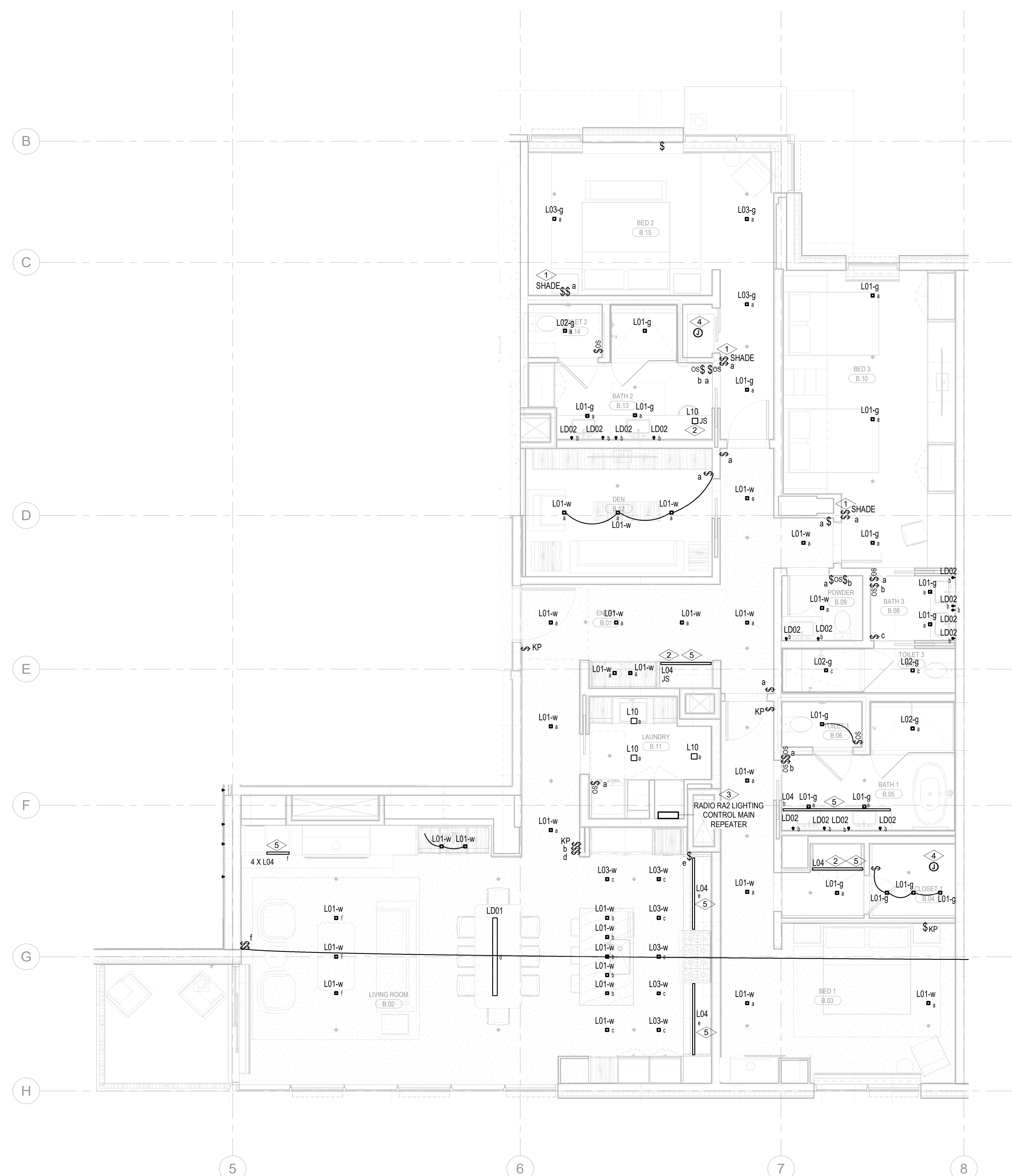
1 TOWER A/B - ELECTRICAL LIGHTING PLAN - UNIT B SCALE: 1/4" = 1'-0"