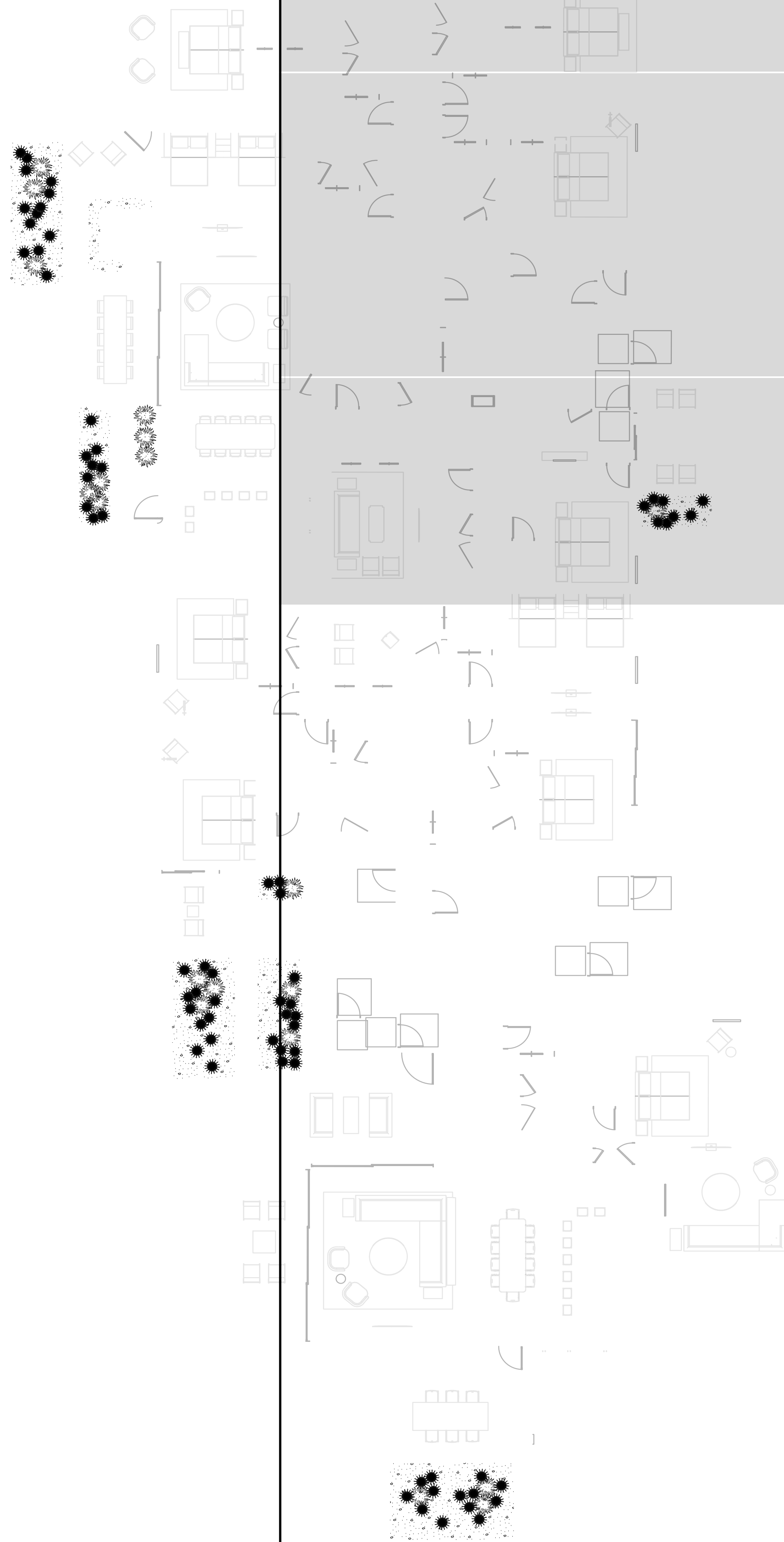
2 BUILDING B - FLOOR 8 1" = 10'-0"