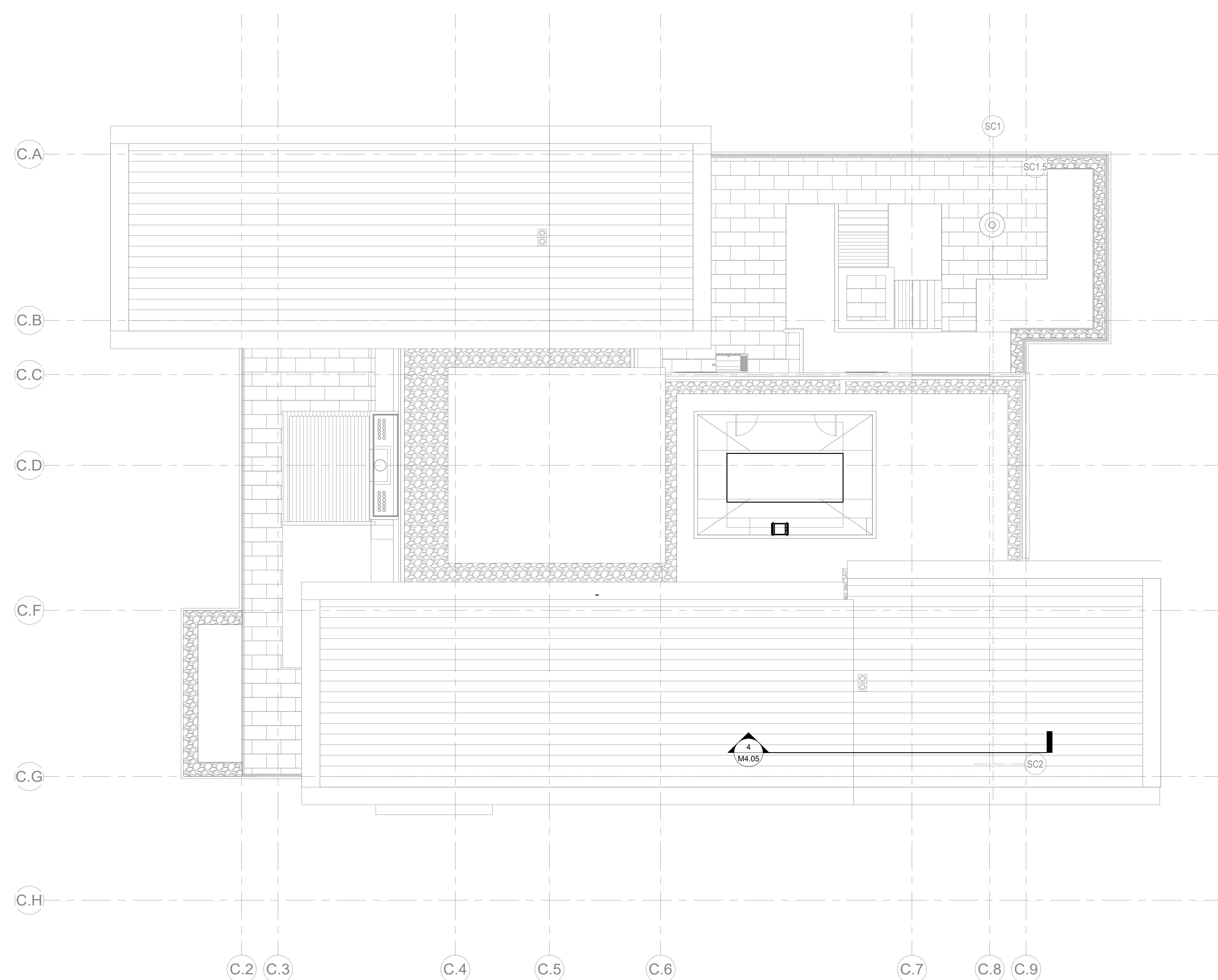
1 TOWER C - ROOF MECHANICAL PIPING PLAN SCALE: 1/8" = 1'-0"