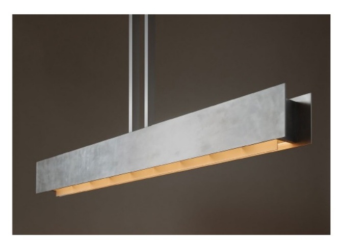
Be Patient Pendant pictured in Hand-finished Aluminum