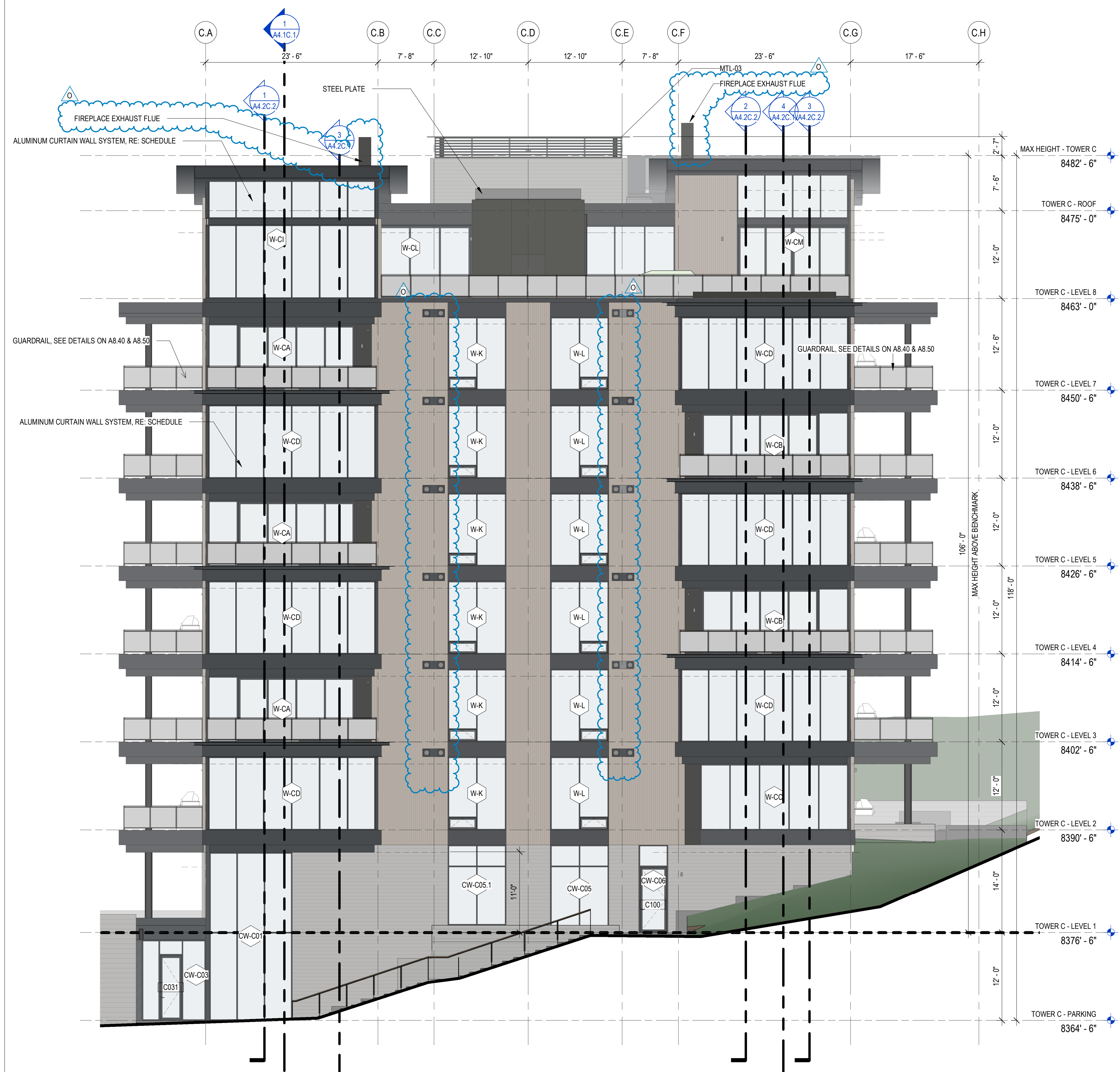
2 TOWER C - WEST SCALE: 1/8" = 1'-0"

NOTE: REFER TO SPECIFICATION DOCUMENTS FOR INFORMATION REGARDING EACH FINISH MATERIAL