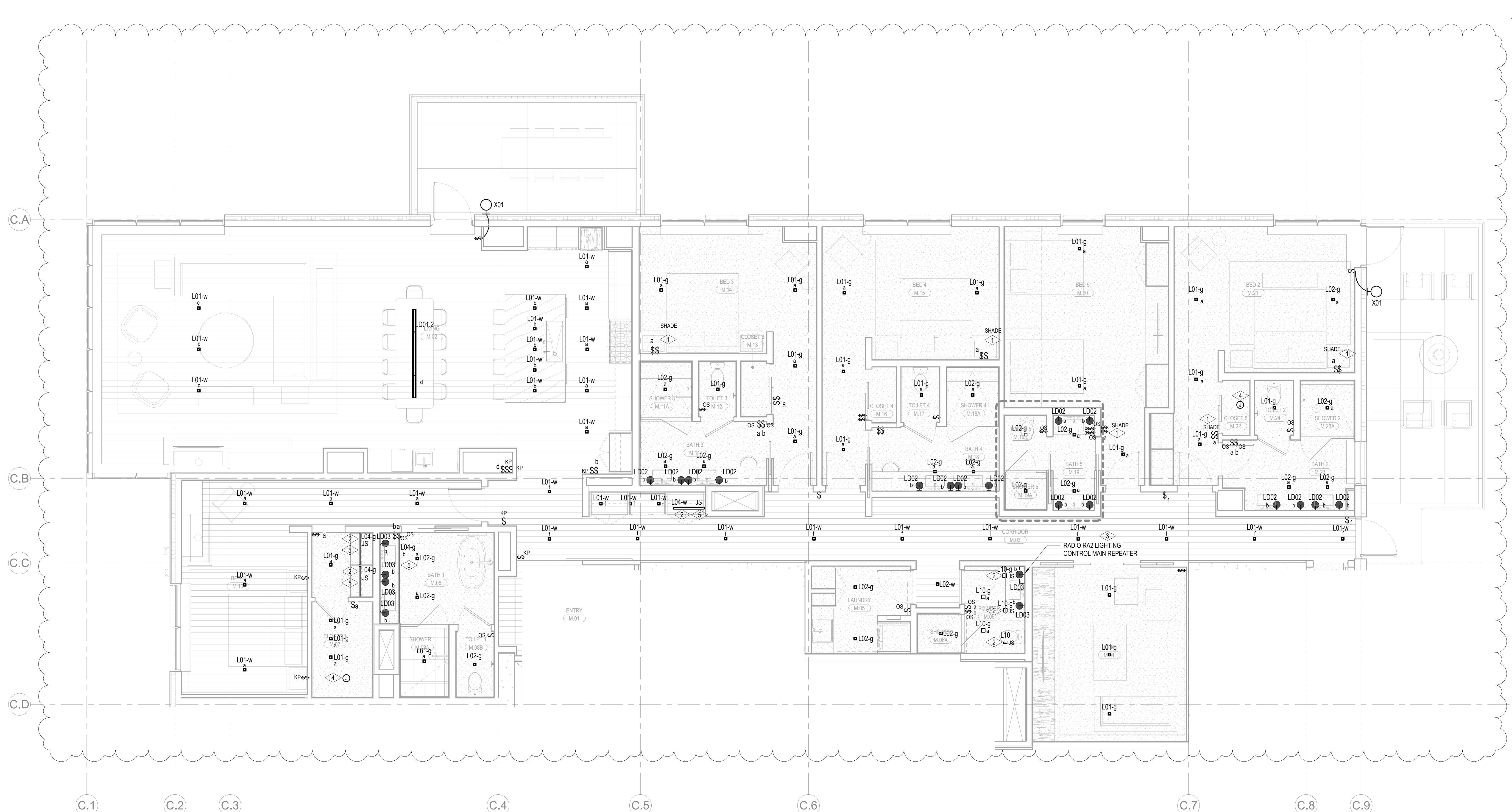
1 TOWER C - ELECTRICAL LIGHTING UNIT PLAN - M SCALE: 1/4" = 1'-0"