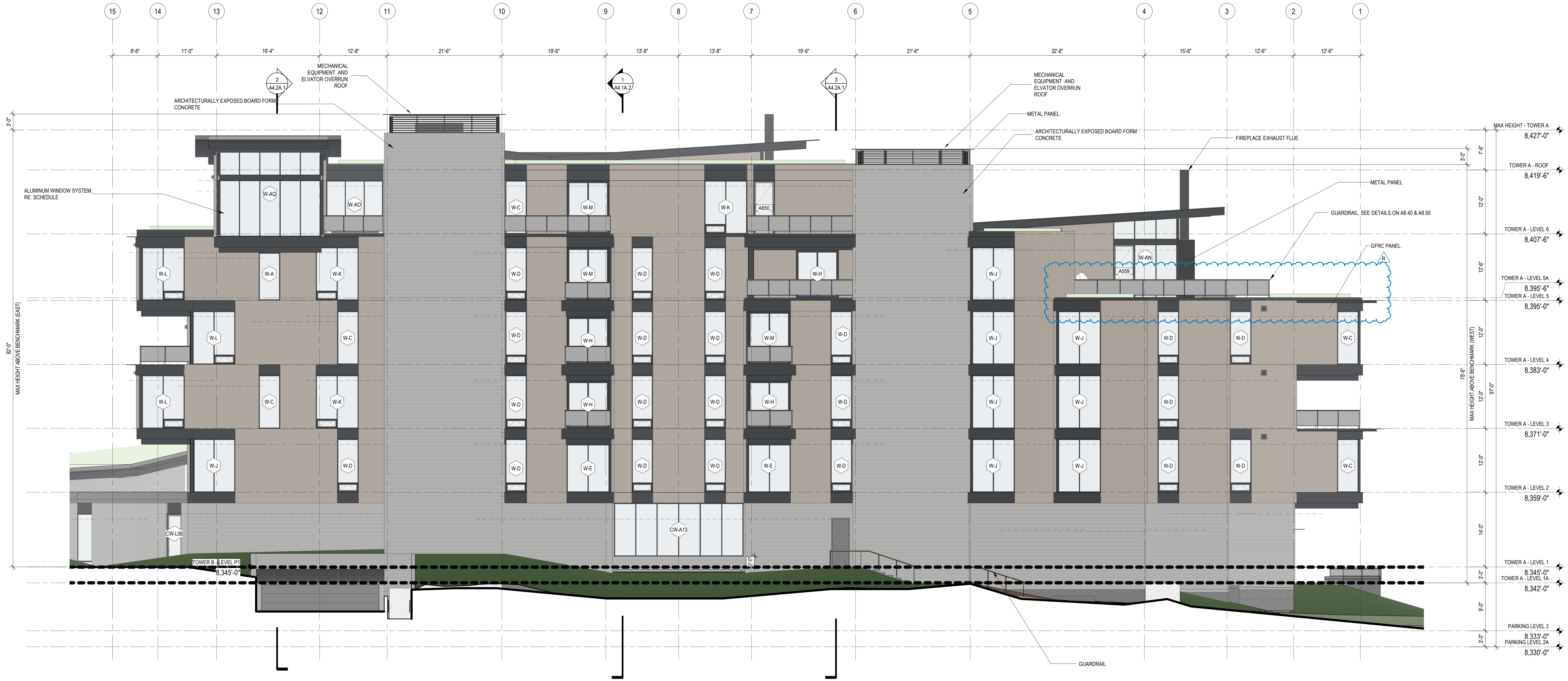
1 TOWER A - NORTH SCALE: 1/8" = 1'-0"