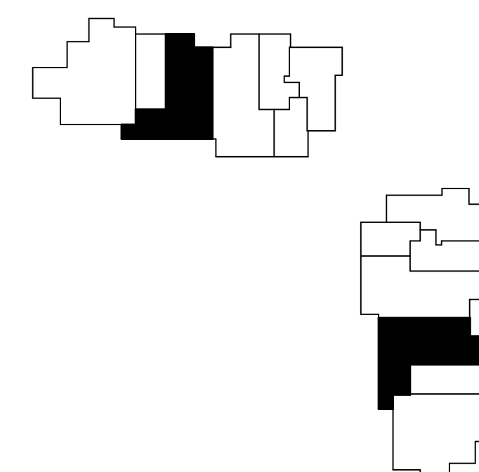
1 TOWER A/B - ELECTRICAL LIGHTING PLAN - UNIT B SCALE: 1/4" = 1'-0"